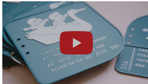
See how innovation and empathy come together to build a more inclusive Singapore.

As NAMIC celebrates our 10th anniversary, we are grateful for the opportunity to contribute back to society through a CSR initiative that reflects our belief in innovation with purpose — Singapore's first 3D-printed Braille book for young children with visual impairments. This Braille book is built upon the know-how of NAMIC Hub@SIT, and the prints are supported by NAMIC hubs.