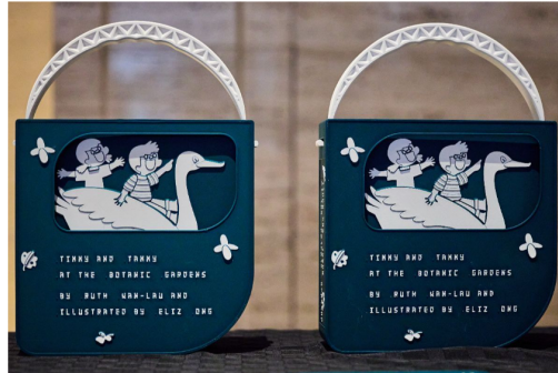
Singapore's first 3D-printed Braille book