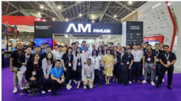
Additive Manufacturing AM Asia

Interact with the vibrant AM ecosystem, enabling innovation and value creation through partnering with start-ups, small-medium enterprises, and large corporations in Singapore and around the world across all industry sectors. The exhibits will also feature global enterprises with innovative AM technology solutions and product applications.