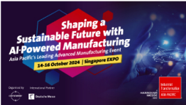
Advanced Manufacturing Industrial Transformation Asia Pacific

Interact with the vibrant AM ecosystem, enabling innovation and value creation through partnering with start-ups, small-medium enterprises, and large corporations in Singapore and around the world across all industry sectors. The exhibits will also feature global enterprises with innovative AM technology solutions and product applications.