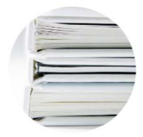
GUIDELINES AND STANDARDS

A platform for network and business matchmaking.