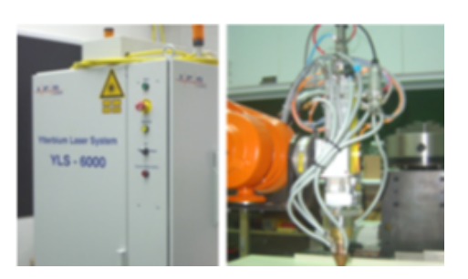
Keppel Offshore & Marine certified by Lloyd's Register, to 3D print offshore