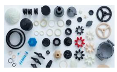
Wilhelmsen's Early Adopter Program for on-demand 3D printed parts in