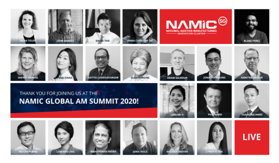
NAMIC Global AM Summit 2020

As one of NAMIC's largest annual events, the summit has successfully migrated online leveraging the <u>ITAP</u> <u>Connect</u> platform, taking place over two days on 21 and 22 October. With an exciting line-up of 12 global thought leaders and 4 expert session chairs, the