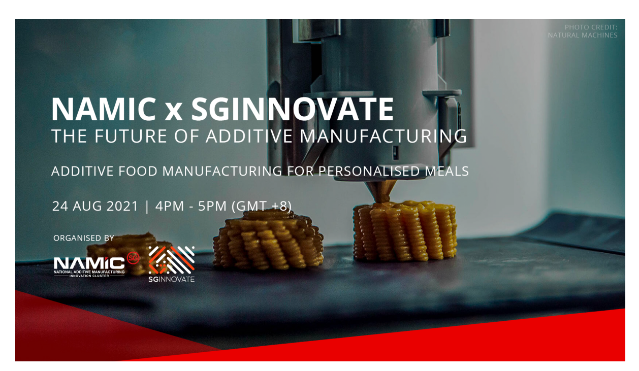
NAMIC x SGInnovate: Additive Food Manufacturing for Personalised Meals

In this hour-long panel discussion, we will dive deep into 3D printing applications in Food, and how 3D printed food enables one of the key pillars in the future of personalized healthcare and sustainability. Join the conversation with 3D printing and food experts from Future Ready Food Safety Hub (FRESH), Natural Machines, Food Innovation & Resource Center of Singapore Polytechnic (SP) and Singapore University of Technology and Design (SUTD) to learn more how the technology empowers all of us with personalized nutrition, especially for dysphagia patients and the elderly.