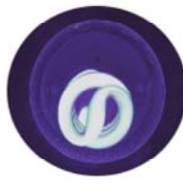
UV Curing System