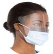
Face Shield Mask