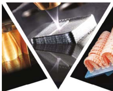
ADDITIVE MANUFACTURING BUSINESS NETWORK DIRECTORY 2019/2020